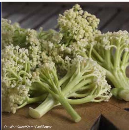
Caulilini® SweetStem® Cauliflower