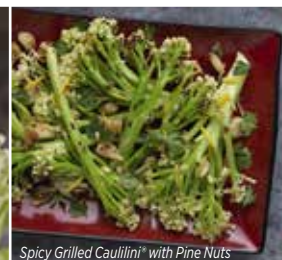
Spicy Grilled Caulilini® with Pine Nuts