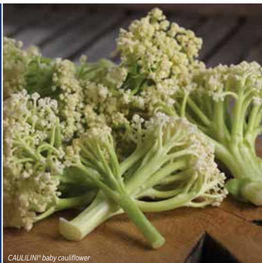
CAULILINI® baby cauliflower