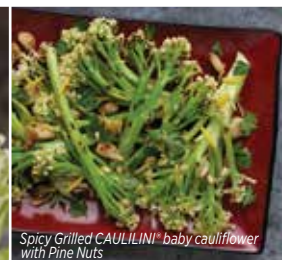
Spicy Grilled CAULILINI® baby cauliflower with Pine Nuts