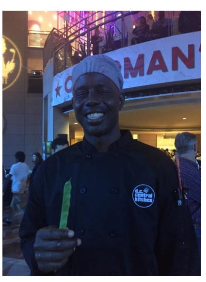
A cook from DC Central Kitchen's culinary training program gives Mann's Tenderbite® Beans some love

"Giving back to the community is a huge part of who we are as a company, especially when we can support organizations that are important to our